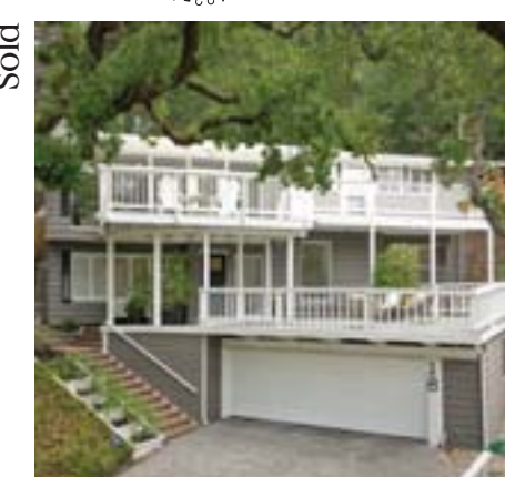
18 La Noria, Orinda Represented Seller

Ranked Top 1.5% of Small Teams in the Country by Real Trends - 2020, 2021